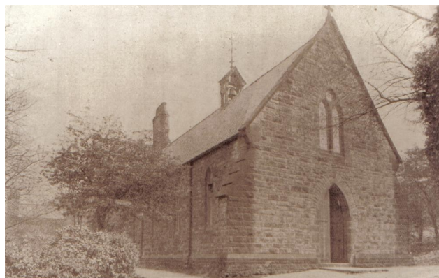
St. Ann's Church, Deepcar with original entrance

The booklet is also available by mail order (cost £3.75 incl Postage), Click here to request details of how to order.